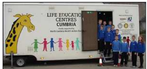
latest type of mobile being used

The Rotary Life Education Melton was formed in order to enable the Melton Mowbray Primary Schools to receive the mobile units in their schools. The Rotary Life Education Melton group comprise of representatives of the two Rotary Clubs in Melton Mowbray and the Sir Richard Raynes Foundation. This means that the schools receive a contribution to the £5 charge of £4 per child. This leaves only £1 per child for the school to pay.