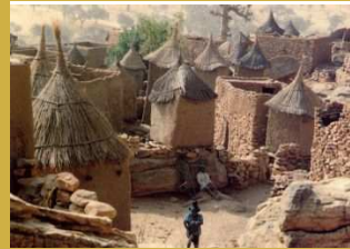
A Dogon Village in Mali