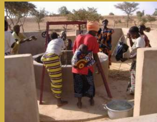
One of the completed wells