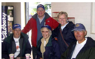
Helpers coffee break