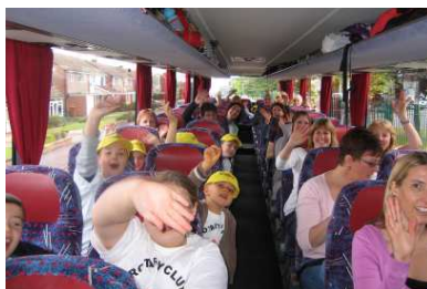
Next stop Wickstead Park