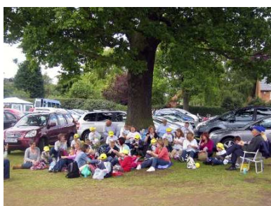
Picnic lunch under a tree

"The Pirate Ship" some of the childrens' favourite ride -