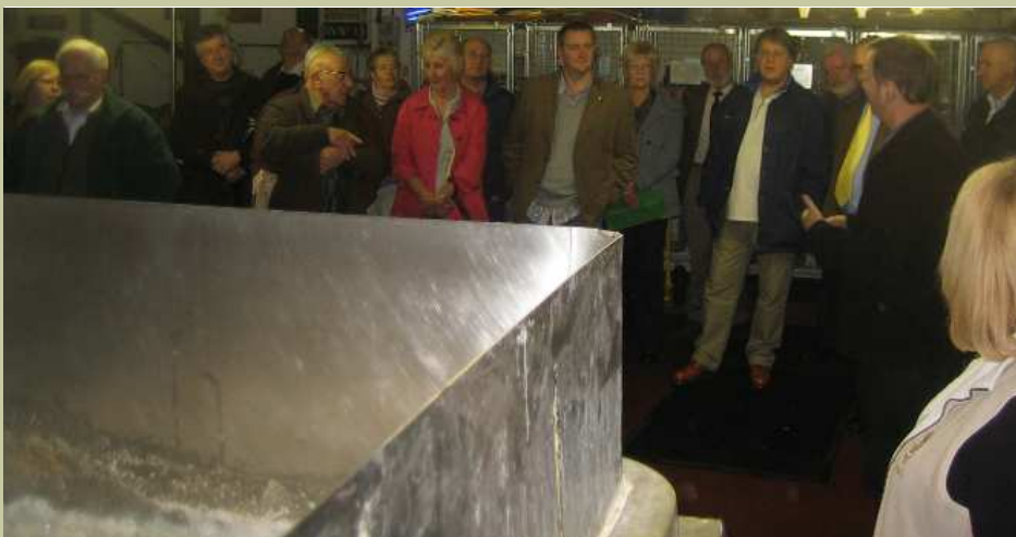
Stainless steel brewing vat where the live yeast is added.

After the presentation we had a very good buffet in the visitor centre and we had samples of the excellent beer they produce.